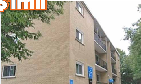
44 LINTON STREET

15 units Kingston, ON | 2011 EXISTING CONSTRUCTION