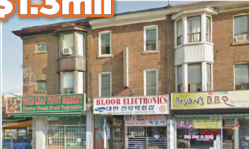
608 BLOOR STREET WEST

2 units Toronto, ON | 2014 EXISTING CONSTRUCTION