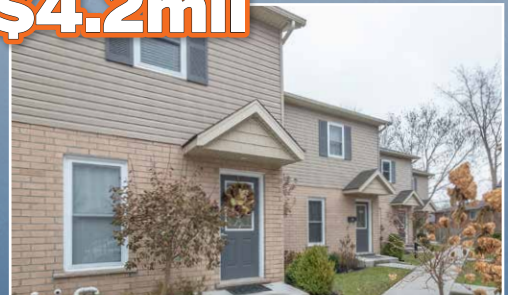
778 CLARE AVENUE