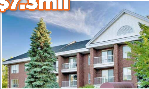
POOLE CREEK MANOR