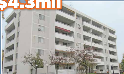
3915 PORTAGE ROAD