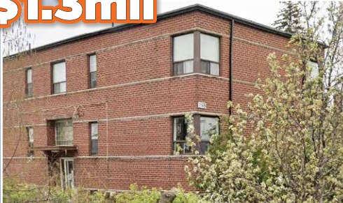
289 BIRMINGHAM STREET