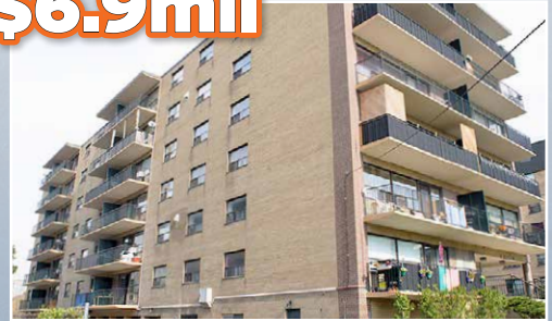
26 GULLIVER ROAD