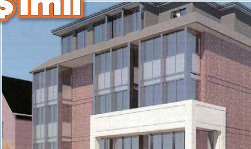
494-500 LISGAR STREET

26 units Ottawa, ON | 2015 LAND - IN PLANNING