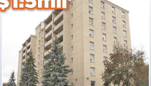
STRANDFORD PLACE II

81 units Niagara Falls, ON | 2012 EXISTING CONSTRUCTION