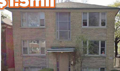
23 STANLEY AVENUE