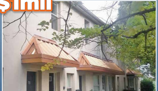
25 HAZEL STREET

10 units St. Catharines, ON | 2017 EXISTING CONSTRUCTION