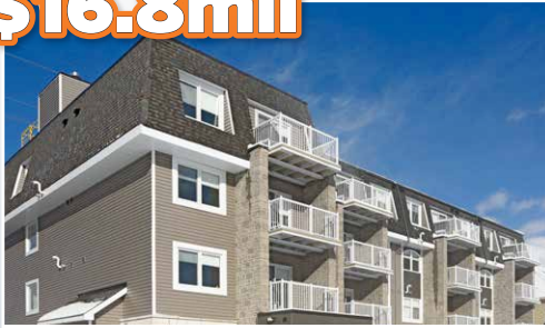
150-160 WHISPERING WINDS WAY