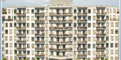
JULIANA PLACE I & II

238 units Woodstock, ON | 2017 NEW CONSTRUCTION