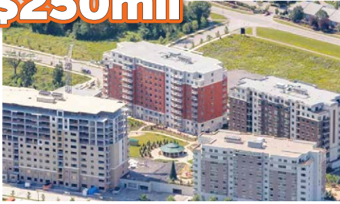
WILLIAM'S COURT AT KANATA LAKES

739 units Kanata, ON | 2012 NEW CONSTRUCTION