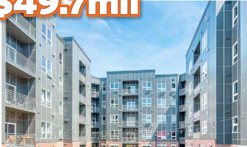
FOUNDRY PRINCESS APARTMENTS