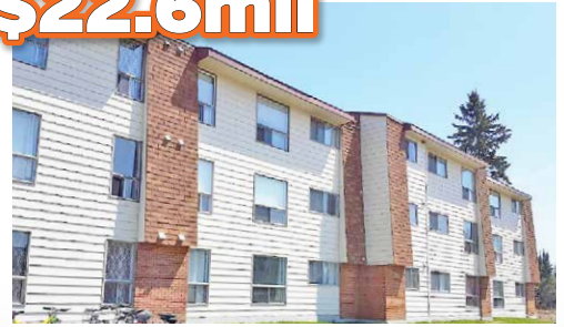
THUNDER BAY PORTFOLIO

289 units Thunder Bay, ON | 2018 EXISTING CONSTRUCTION