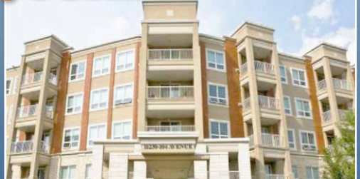
OLIVER VILLAGE - THE ASHBY & BRIGHTON

308 units Edmonton, AB | 2010 NEW CONSTRUCTION