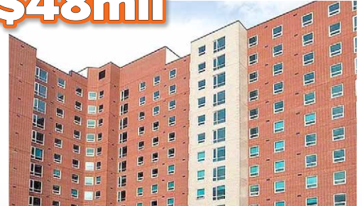
THE RESIDENCES ON FIRST