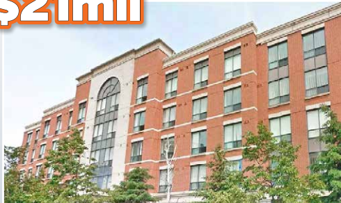
FORESITE - LIBERTY SUITES

63 units Thornhill, ON | 2019 NEW CONSTRUCTION