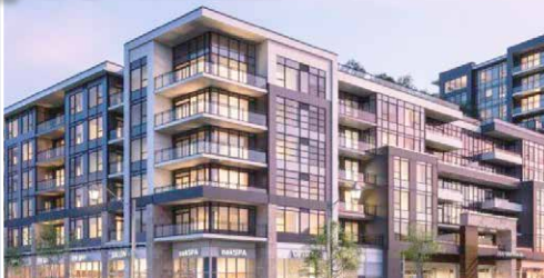
THE TAUNTON LUXURY APTS

286 units Oakville, ON | 2019 LEASE-UP BY SVN ROCK ADVISORS INC.