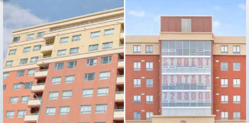
VILLAGE SUITES & WEST VILLAGE SUITES

1,042 beds Hamilton & Oshawa, ON | 2012 NEW CONSTRUCTION - STUDENT RESIDENCE