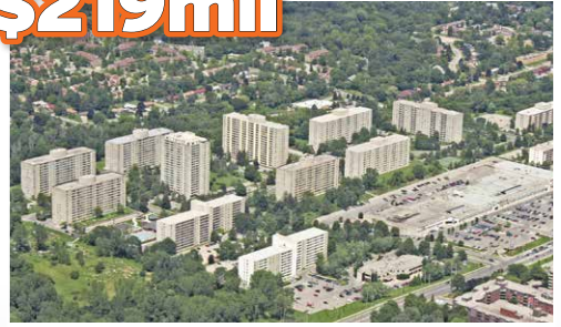
CHERRYHILL VILLAGE APARTMENTS

2,326 units London, ON | 2011 EXISTING CONSTRUCTION