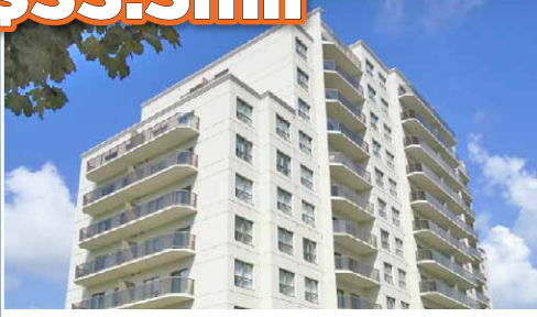
RICHMOND ROW LUXURY APTS