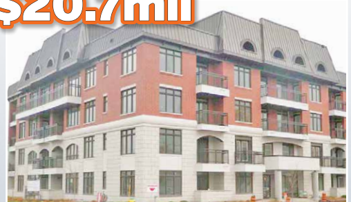
151 GREENBANK ROAD

60 units Nepean, ON | 2018 NEW CONSTRUCTION