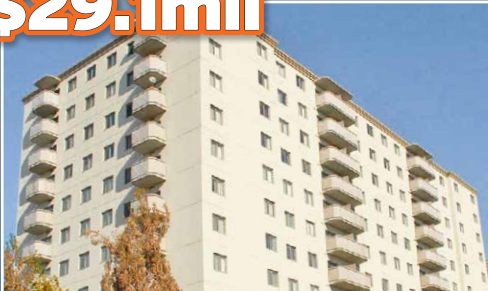
THE MARQ LONDON