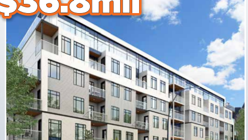
THE VICTORIA ON 5TH