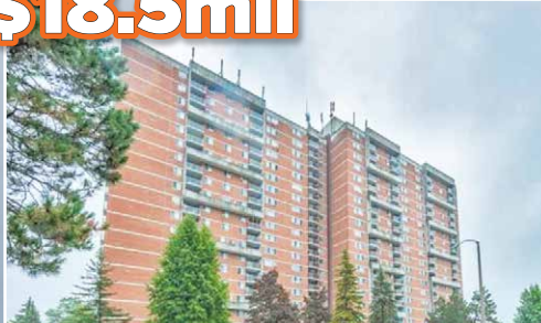
100 WINGARDEN COURT

266 units Scarborough, ON | 2010 EXISTING CONSTRUCTION - CONDOMINIUMS