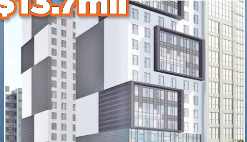
TEXTBOOK STUDENT HOUSING PORTFOLIO

923 beds Kingston/Ottawa, ON | 2018 UNDER CONSTRUCTION - STUDENT RESIDENCE