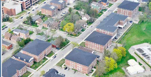
EZRA-BRICKER STUDENT APTS

790 beds Waterloo, ON | 2012 NEW CONSTRUCTION - STUDENT RESIDENCE