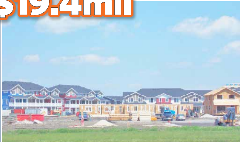
LUMEN at SOUTH POINTE

148 units Winnipeg, MB | 2015 NEW CONSTRUCTION - TOWNHOMES