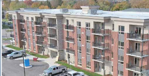
25, 45, 85, & 105 OXFORD STREET

236 units Stratford, ON | 2019 NEW CONSTRUCTION