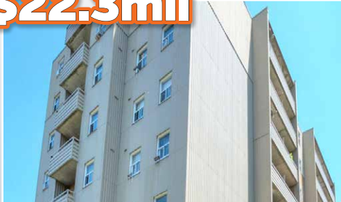
RIVER RIDGE TOWERS