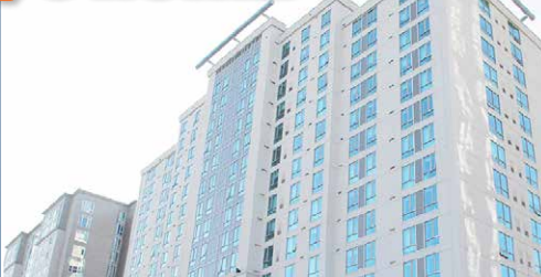
KING STREET TOWERS 1 & 2

988 beds Waterloo, ON | 2013 NEW CONSTRUCTION - STUDENT RESIDENCE