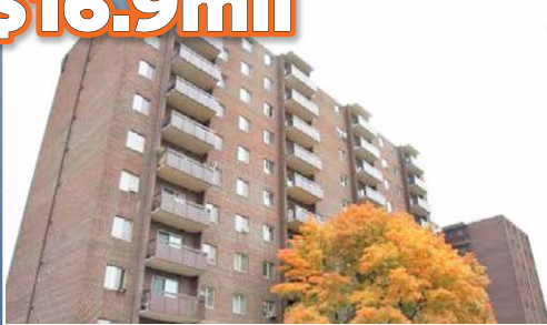
GLEN EDEN COURT

163 units Milton, ON | 2007 EXISTING CONSTRUCTION