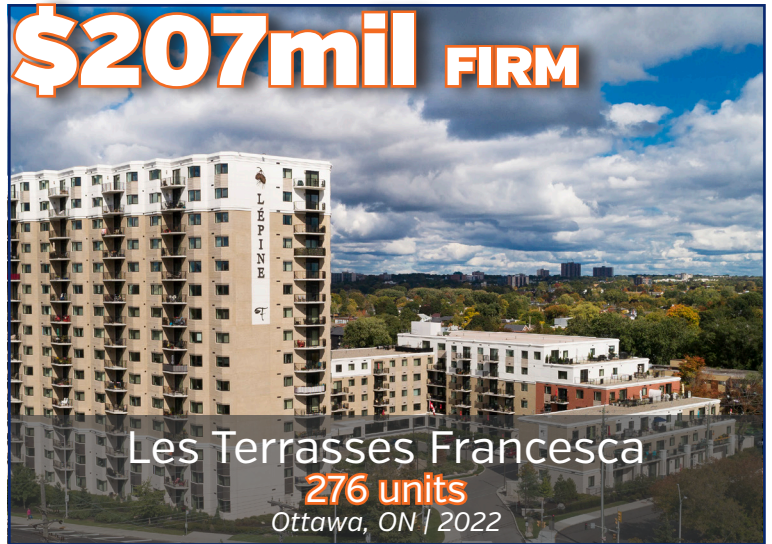
Les Terrasses Francesca 276 units Ottawa, ON | 2022