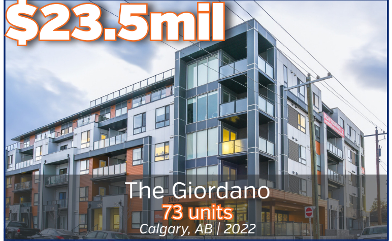
The Giordano 73 units Calgary, AB | 2022