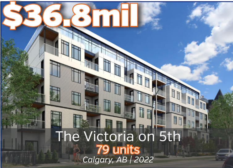
The Victoria on 5th 79 units Calgary, AB | 2022