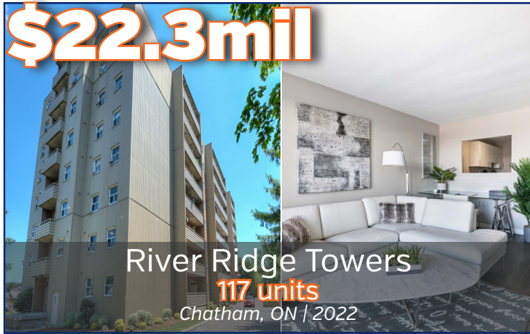
River Ridge Towers 117 units Chatham, ON | 2022