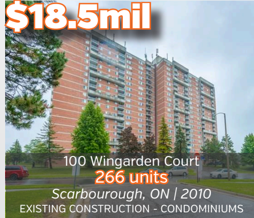
100 Wingarden Court 266 units Scarborough, ON | 2010 EXISTING CONSTRUCTION - CONDOMINIUMS