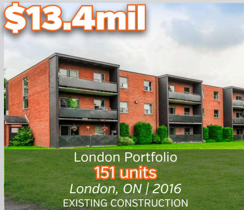
London Portfolio 151 units London, ON | 2016 EXISTING CONSTRUCTION