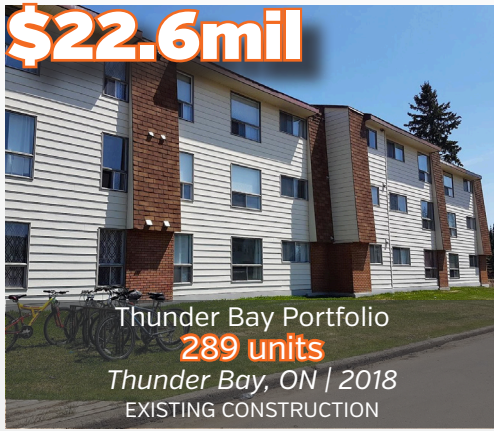
Thunder Bay Portfolio 289 units Thunder Bay, ON | 2018 EXISTING CONSTRUCTION