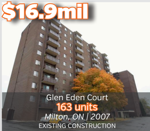
Glen Eden Court 163 units Milton, ON | 2007 EXISTING CONSTRUCTION