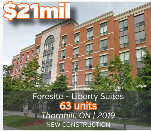
Foresite - Liberty Suites 63 units Thornhill, ON | 2019 NEW CONSTRUCTION