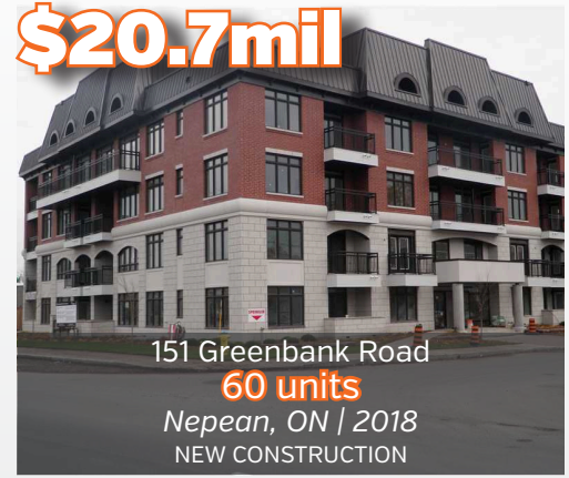
151 Greenbank Road 60 units Nepean, ON | 2018 NEW CONSTRUCTION