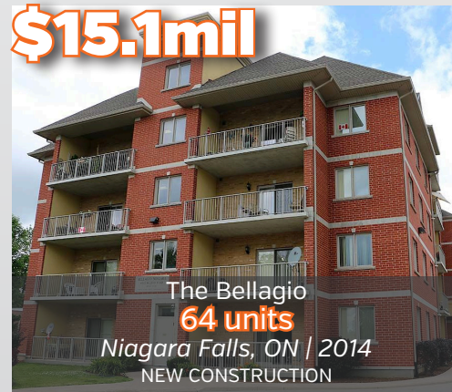
The Bellagio 64 units Niagara Falls, ON | 2014 NEW CONSTRUCTION