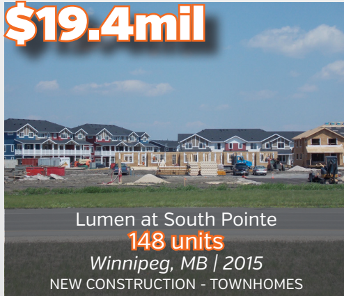
Lumen at South Pointe 148 units Winnipeg, MB | 2015 NEW CONSTRUCTION - TOWNHOMES