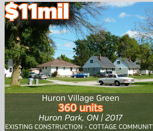
Huron Village Green 360 units Huron Park, ON | 2017 EXISTING CONSTRUCTION - COTTAGE COMMUNITY