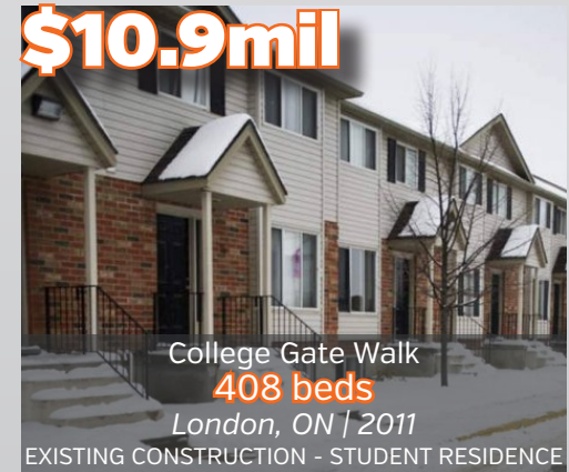
College Gate Walk 408 beds London, ON | 2011 EXISTING CONSTRUCTION - STUDENT RESIDENCE