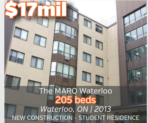
The MARQ Waterloo 205 beds Waterloo, ON | 2013 NEW CONSTRUCTION - STUDENT RESIDENCE