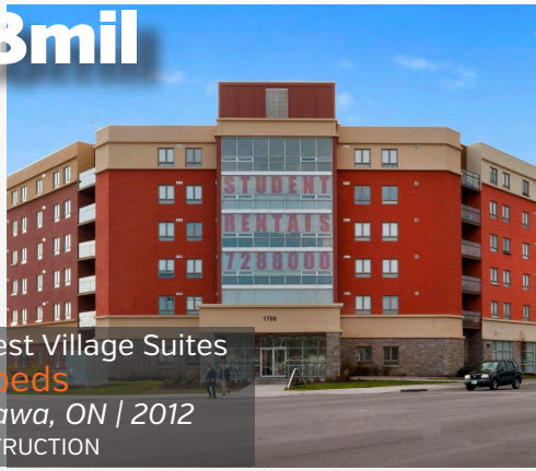
Village Suites & West Village Suites 1042 beds Hamilton & Oshawa, ON | 2012 NEW CONSTRUCTION