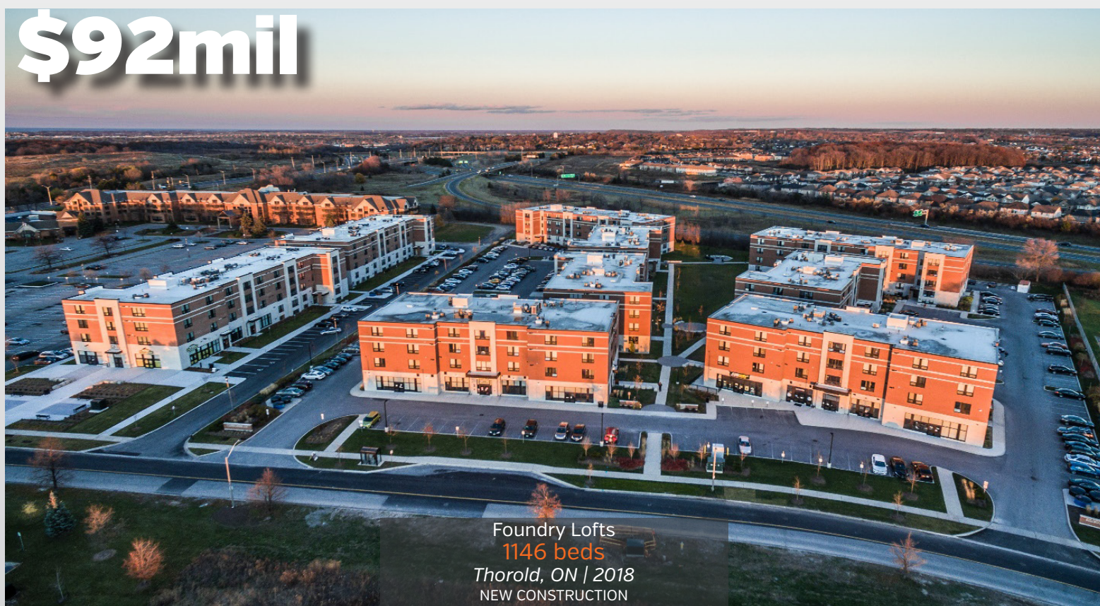
Foundry Lofts 1146 beds Thorold, ON | 2018 NEW CONSTRUCTION